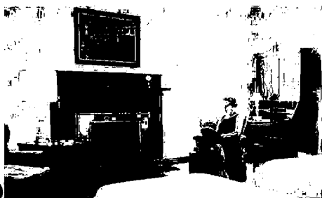
A view of the master bedroom in the Alumni House.