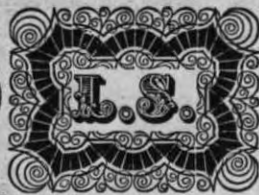
Auditor General of the State of Michigan.

, as aforesaid, has hereunto set his hand and seal the day and year first above written.