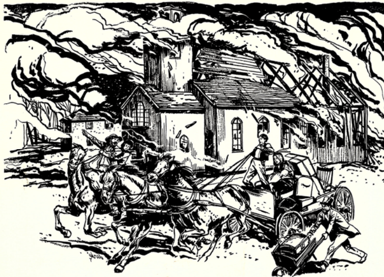
HOLLAND'S DISASTROUS FIRE - 1871

For the purpose of recounting events around the fire for Quarterly readers of this tragic event that took place 144 years ago, I have selected excerpts from the detailed “A Contemporary Account of the Holland Fire,” included in a number of books about Holland.