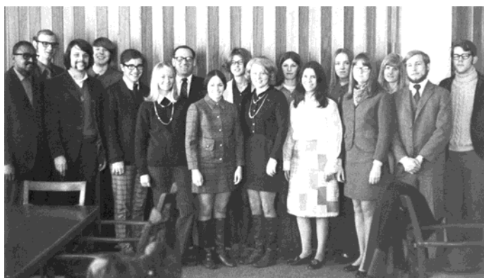
Student Church members, 1970

Holland to promote understanding of the people and diversity of the church. Retreats at Camp Geneva and Cran-Hill Ranch, and weekends at the Ecumenical Institute in Chicago offered students a change to reassess themselves, their role in the church and the church’s role in contemporary society.