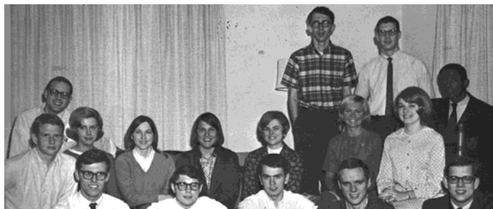
Student Church members, 1967

This offering was necessary as the church hoped to become self-supporting and not need the funding originally granted by the school. The September 23, 1966, Anchor reported that in order to be self-supporting, money would be required to cover the cost of bulletins, expenses for guest speakers, and support the work projects for the student organizations. Though the Student Church was given a tentative budget of $4,800 by the school for its first year, they expected the attendees to provide enough financial support through the offering for financial support in the future. Following the completion of this first trial year, the Student Church Board of Trustees would be required to report to the college on the effectiveness and degree of participation in the church, and if they believed the church should continue operating. Finally, the new board would be elected by the students in the church for the following year rather than by the Religious Life Committee.