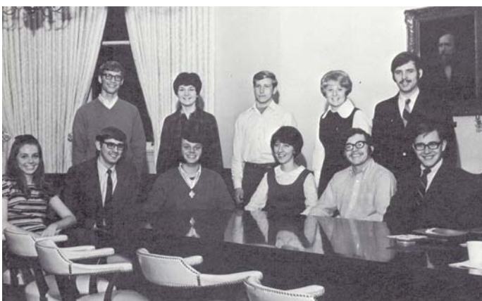
Student Church members, 1969

These activities by the church continued into 1969 as they maintained organizing spring break work trips, sponsored by the Student Senate as well as the chaplain’s office, to Alabama, Holland, and Cleveland. The Student Church also continued working on new task forces, including one focused on students who were “down on their religious up-bringing” for introspection and determination for what those students wanted to be different. They also continued the discussion groups with one focusing on Malcom-X and created an inner-city task force to discuss the problems in inner-city America. Lastly, the Coffee Grounds continued to flourish as students used it for performances, meetings, discussion groups, and outreach.