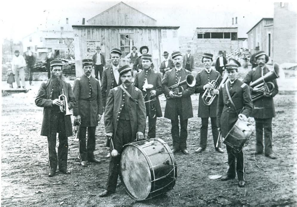
Holland Historical Trust

Contact us at (616) 395-7798 • Fax (616) 395-7197 • E-mail: archives@hope.edu • www.jointarchives.org