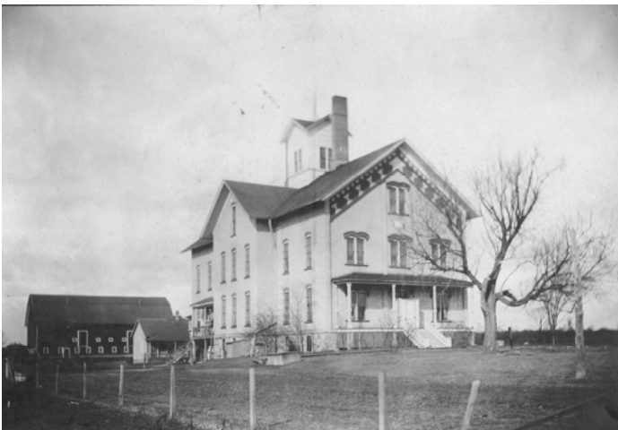
Eastmanville Poor Farm, ca. 1895