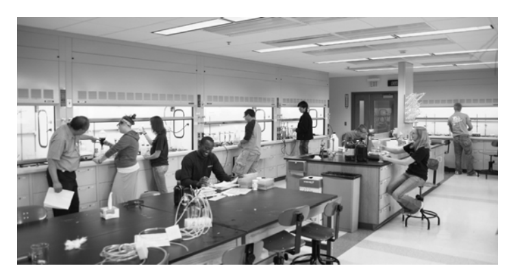
Modern lab in the A. Paul Schaap Science Center

Hope College embraces an institutional core liberal arts curriculum emphasizing interdisciplinary learning and educating the entire person: mind, body, and spirit. The chemistry, nursing, and engineering programs are respectively accredited by the American Chemical Society, the Commission on Collegiate Nursing Education, and the Engineering Commission of the Accreditation Board for Engineering and Technology. Furthermore, Hope continues the tradition of research as a central and foundational component of the teaching philosophy. Students are given the opportunity to participate in meaningful research projects with faculty mentors. These programs are funded by numerous sources: National Science Foundation, National Institutes of Health, Homeland Security, Research Corporation, Petroleum Research Fund, Whitaker Foundation, Pew Foundation, National Aeronautics and Space Administration and the Michigan Space Grant Consortium, Howard Hughes Medical Institute, and others. In 2008, the science division received more than $3 million in external grants and awards. Students are often co-authors of publications in scientific journals and present their discoveries at regional and national professional meetings. In 2008, the faculty produced close to twice the national average number of scientific publications among