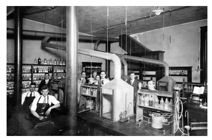
Chemistry students at work in a new state-of-the-art science lab in Van Raalte Hall, 1904

The vision and leadership of the 1900s formed a pivotal foundation for the emerging science education, and this foundation has held the strength for the future continuing pursuit of excellence in science education at Hope College. Despite the tough economic times of the late Depression era, fundraising began for a new building to house the science