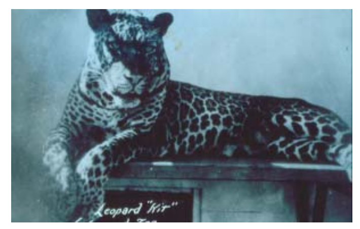
Kit, the leopard

The collection began with poultry that was exhibited at local fairs and poultry shows in Holland. It was at these fairs and shows that his larger animals began to appear and included Toulouse geese, pheasants, a sun bear from Japan, monkeys from Madagascar, camels and stallions from Arabia, donkeys from Israel, dogs from Europe, raccoons, black bear and dogfaced baboons. The planned addition of an elephant to the collection that year failed when the elephant died on the ship during transport, but its shipmates, the donkeys and camels, survived the trip from Israel. Other animals were