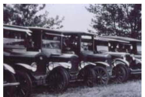
Autos lined up at Lakewood Farm, c. late-1920s

sparked the storm of visitors that would visit Lakewood Farm for years to come. An estimated 800,000 visited during the summer of 1926.