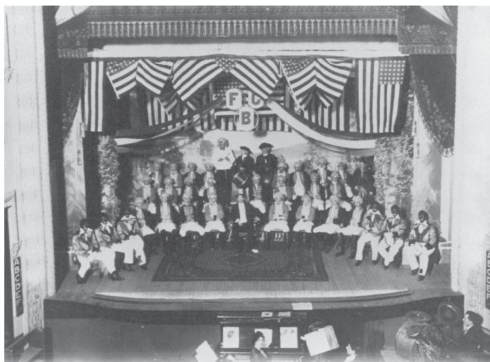
Vaudeville act from the early days