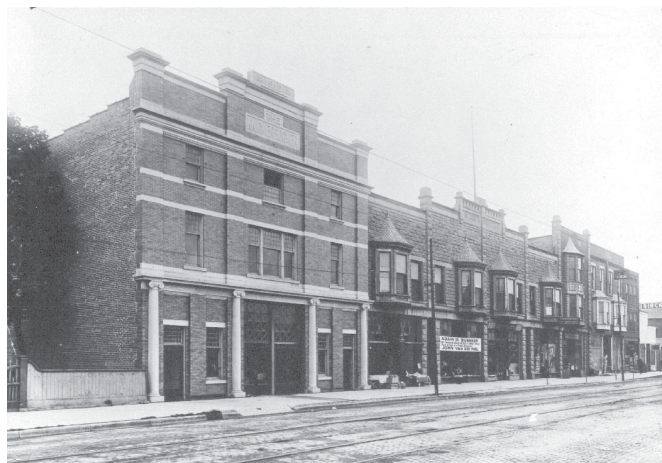
The Knickerbocker Theatre in 1911