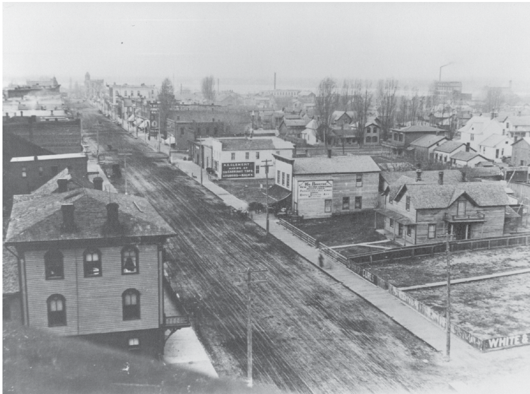
Holland's East 8th Street business district before the construction of the Knickerbocker