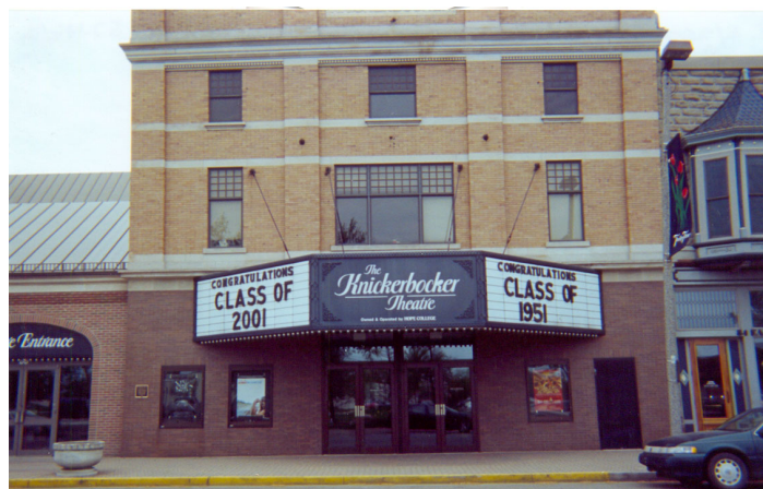
The Knickerbocker Theatre as it appears today