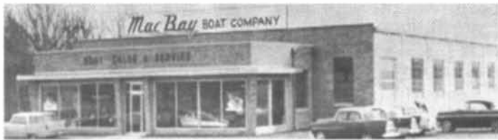
Mac Bay Boat Company in Muskegon Heights, 1956