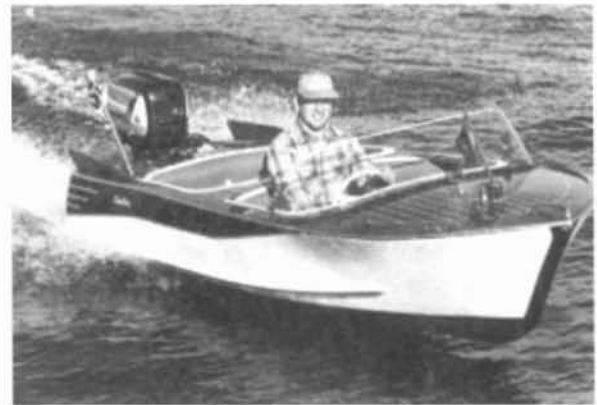
A 1957 Mac Bay 13' Thunderbolt

In an attempt to trim costs and still sell a quality boat, Mac Bay outsourced its upholstery and canvas work to Holland based companies. Auto Top did the upholstery work and Holland Awning constructed the canvas covers for many years, picking up and dropping off work regularly. They also cut costs by creating a dealership network that covered the United States and was serviced by salesman traveling with trailers containing the latest models of Mac Bay. Salespersons offered incentives to buy at large amounts at discounted rates. This way the factory could continue to run throughout the year and employ a consistent and trained workforce—the key to quality boat making. Nationally known dealers first learned of the company at national boats shows and would eventually set up dealerships in Brighton, Michigan; Corbin, Kentucky; and Amarillo, Texas, to name a few.