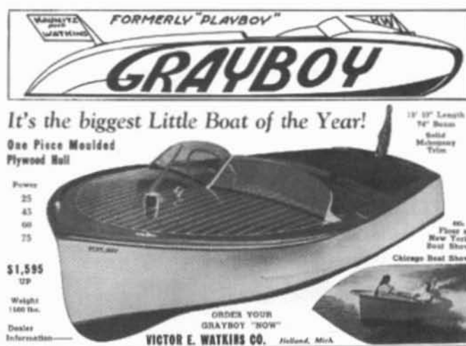
1949 brochure illustrating the name change made by Mac Bay due to a lawsuit

After Watkins' death, sales dipped dramatically according to sources associated with the company. Soon after this