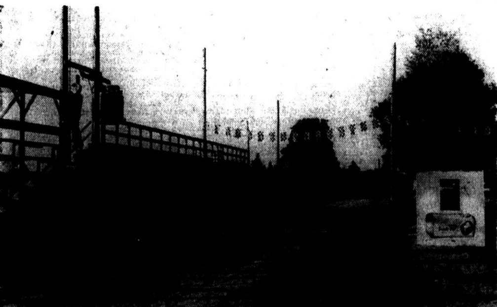
FAIR ATMOSPHERE — Some gaily checkered flags have been put up at the Ottawa County Fairgrounds, located at the North Shore Community grounds to give plenty of fair atmosphere to the area. The Fair will be held Aug. 5-8. Here Ken Dekker (left) and Lefty Van Gelderen are lining up one of the rows of checkered flags.

Vandals who Tuesday evening began spraying paint on buildings in the City Wednesday evening carried on their activities, again smearing the Citizens Transfer Co. building on River Ave., the old Center Theater on Eighth St., the workmen's buildings at 10th St. and Columbia Ave. near Hope College's new dormitory and various other buildings, fences, etc. Holland police are investigating.