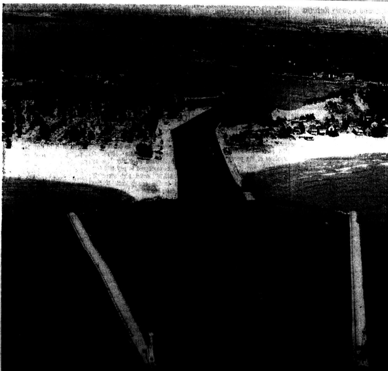
WELCOMING ARMS—The welcoming arms of the Holland harbor piers reach out into Lake Michigan, offering harbor for the many visitors during the summer boating and resort season. However, larger craft, such as tankers, often have difficulty in maneuvering through the sharp and narrow turns

STATE FARM MUTUAL AUTOMOBILE INSURANCE COMPANY Hartford, Conn. 06183