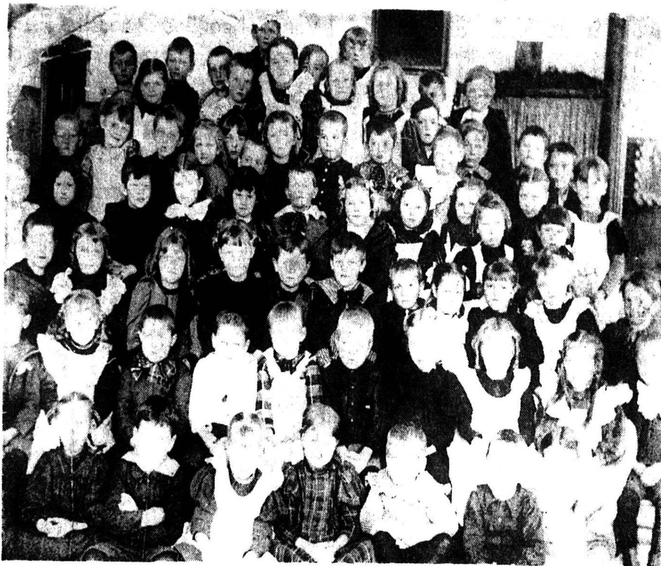
Kindergarten Class of 62 Years Ago Pose at Maple Street School