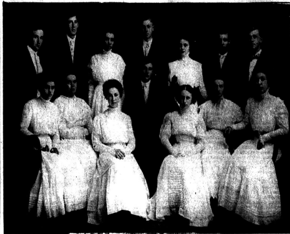
High School on Graves Place Scene of Exercises