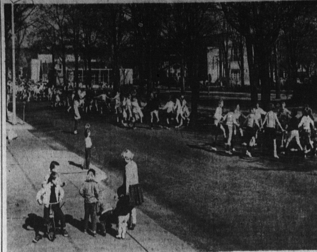
DANCERS NEAR END OF DRILLS—Holland High's famed klompen dancers, practicing on 10th St., in the post office block this week, have only two afternoon practice sessions left before dress rehearsal next Monday night. Each afternoon finds several small groups of youngsters watching and imitating the Dutch

He also won the a reference book given as the Bratol Laboratory Award for outstanding achievement.