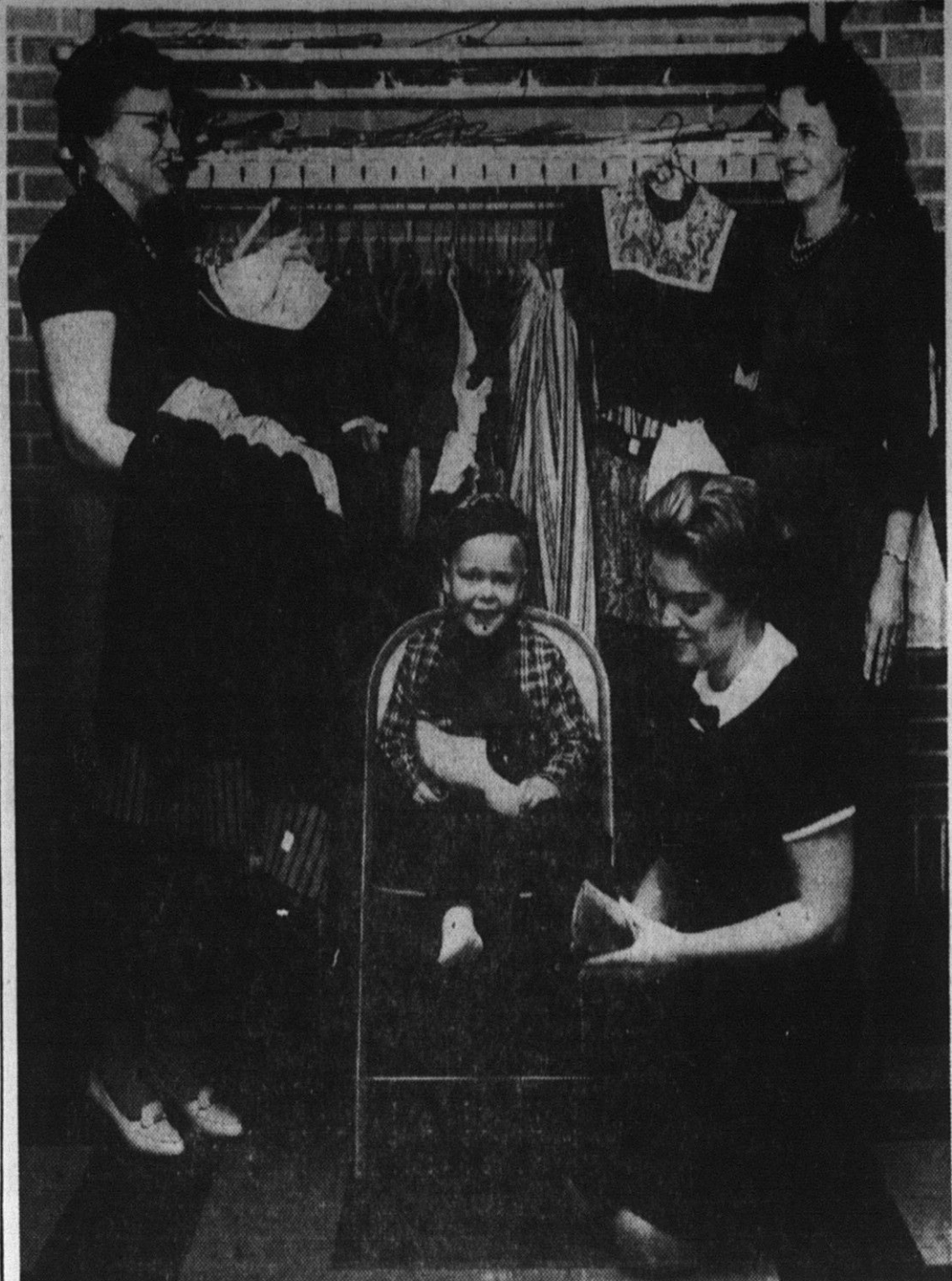
DUTCH COSTUME EXCHANGE — This is the final week for the Newcomers Club Dutch costume exchange at the Civic Center. Wednesday was the deadline for bringing in costumes to be sold. Hours at the exchange are daily from 1:30 until 4:30 p.m. with a 9 p.m. deadline on Friday. The telephone number at the exchange is EX 6-3456. Persons who have Dutch costumes they wish