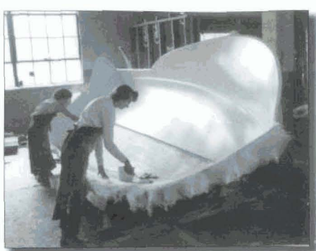
Women have a higher attention to detail working with fiberglass.

As the pleasure craft builders of Michigan struggled to survive the Great Depression, the Smith family, owners of the Chris-Craft Boat Company, decided to build the largest factory in the history of the company in Holland in 1939, to produce wooden, and later, fiberglass cruisers. A successor owner to the Smith family closed the plant in 1988