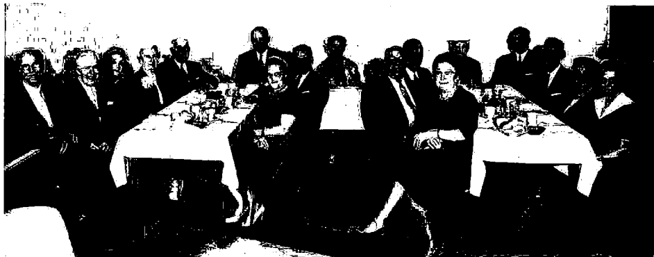
CLASS OF 1918