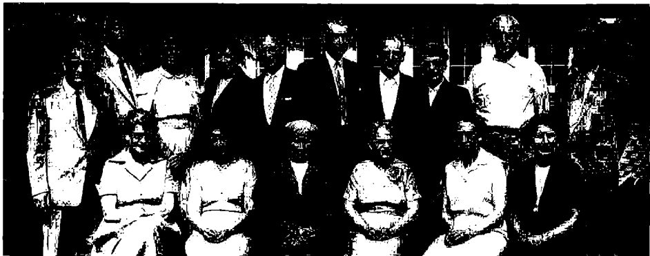
CLASS OF 1923