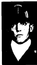
of the 7822nd Army Unit. He entered