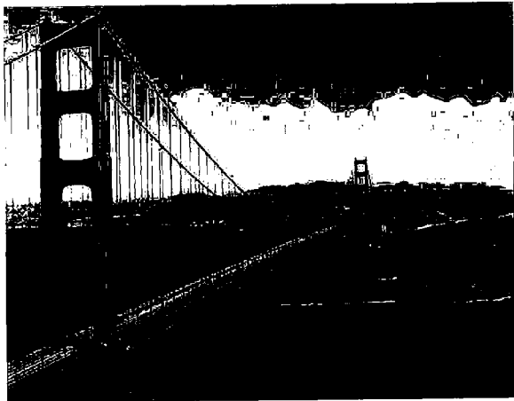
Golden Gate Bridge, San Francisco, designed by Clifford E. Paine '11N.

garding bridge construction that had not received general acceptance. Galloping Gertie, Tacoma, Washington's famous suspension bridge collapsed in a heavy windstorm and the twenty-three insurance companies involved engaged him to investigate the cause of the failure and to make recommendations for future construction. Up until this time wind had only been a problem in bridge construction when it occurred at a constant velocity and direction for long periods of time. The Tacoma Narrows bridge was a victim of all three factors. The accepted theory in counteracting wind was to build a suspension bridge in the form of an inverted 'U', the pillars forming the vertical parts and the bridge itself, the horizontal. Vents in the form of gratings were