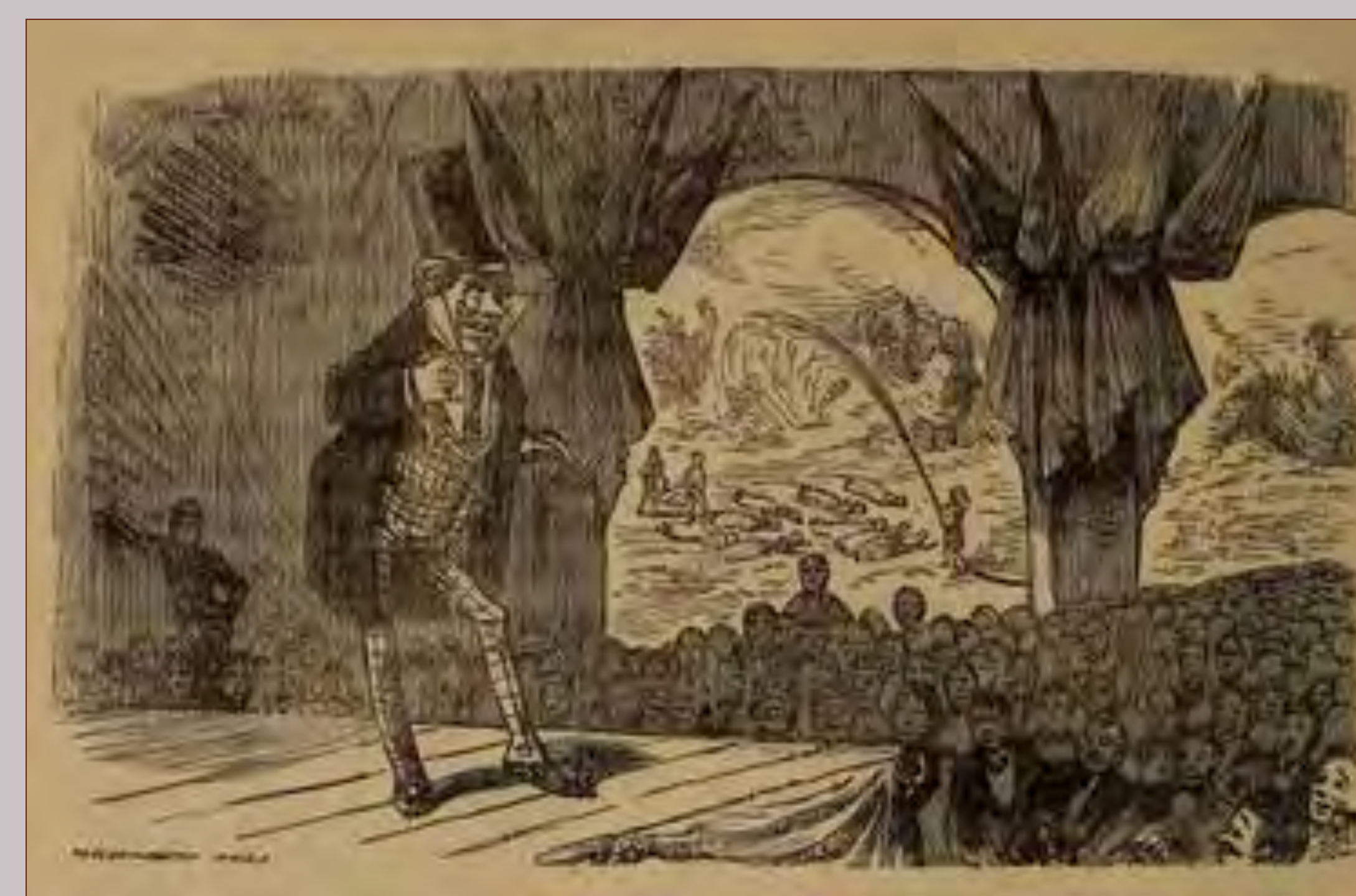
A depiction of one of the Exhibition ceremonies from Our Show .